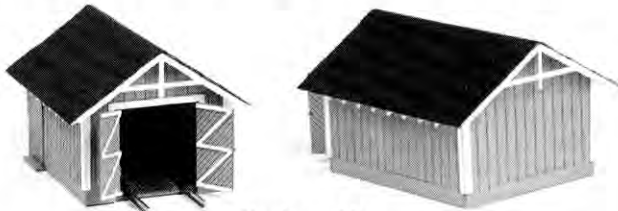
2 Sheds per kit.

The L&N Historical Society is proud to announce the first production run of a new HO scale structure. This L&N prototype kit is now in stock at the L&NHS Company Store. In cooperation with the society, American Model Builders has produced Kit No. 182 — L&N Standard Tool Sheds. Each kit is designed from actual plans of tool sheds that were used by the L&N Railroad system-wide in all eras and even into the CSX era. Each wooden laser kit contains two shed kits and also has enough lengths of rail to make the kits into handcar sheds. These sheds were located along the main line, at sidings, and in yards at intervals of three to 10 miles and often appeared in groups of two or three at many locations.