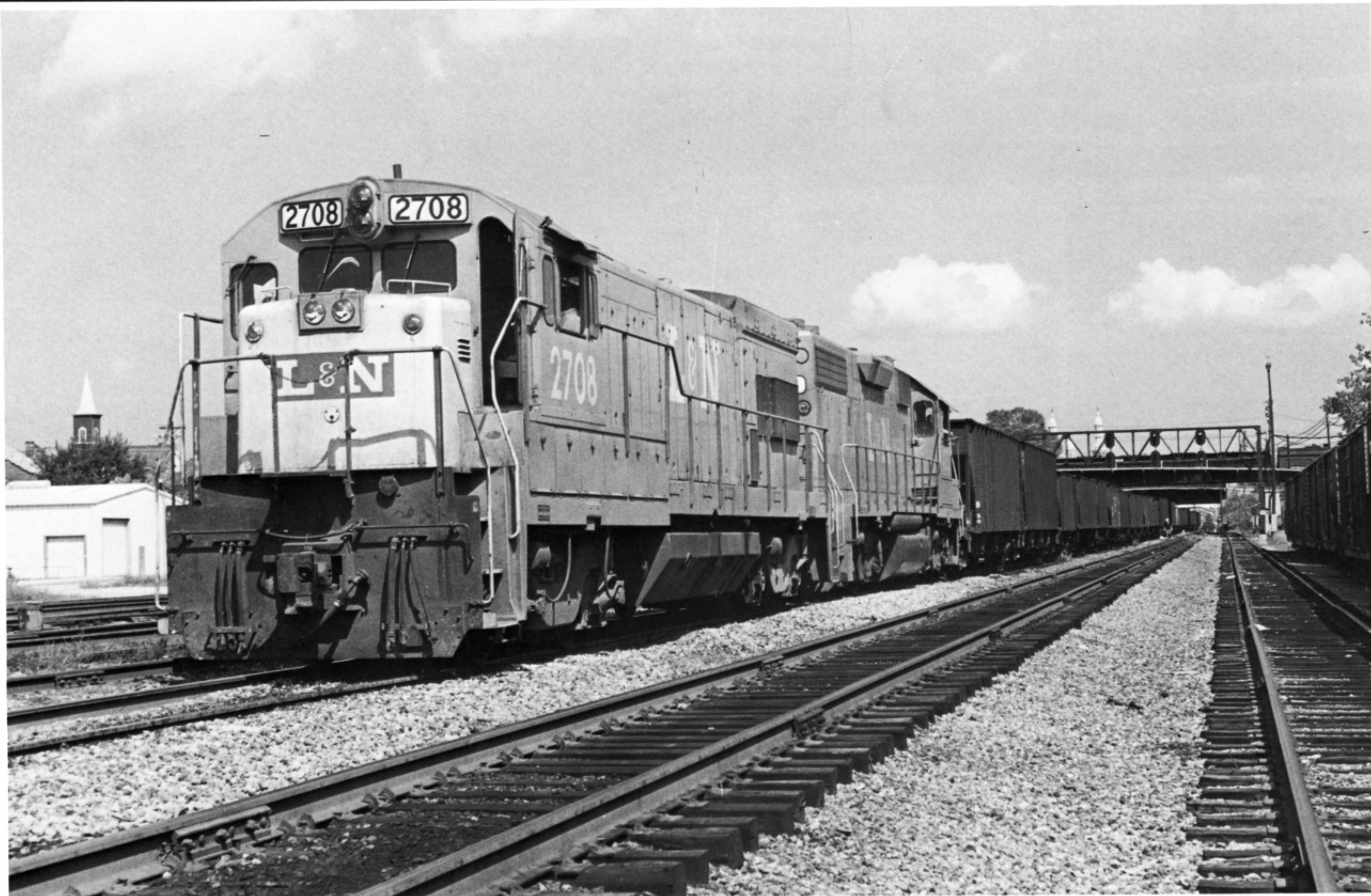
L&N acquired eight U23B's in its merger with the Monon in 1971. Impressed by the four-axle GE units, orders for more soon followed. No. 2708 was the first of the new units on the property. On August 28, 1977, the U-Boat leads a GP38-2 on a cut of southbound empty hoppers at busy KC Tower in Covington, Kentucky.