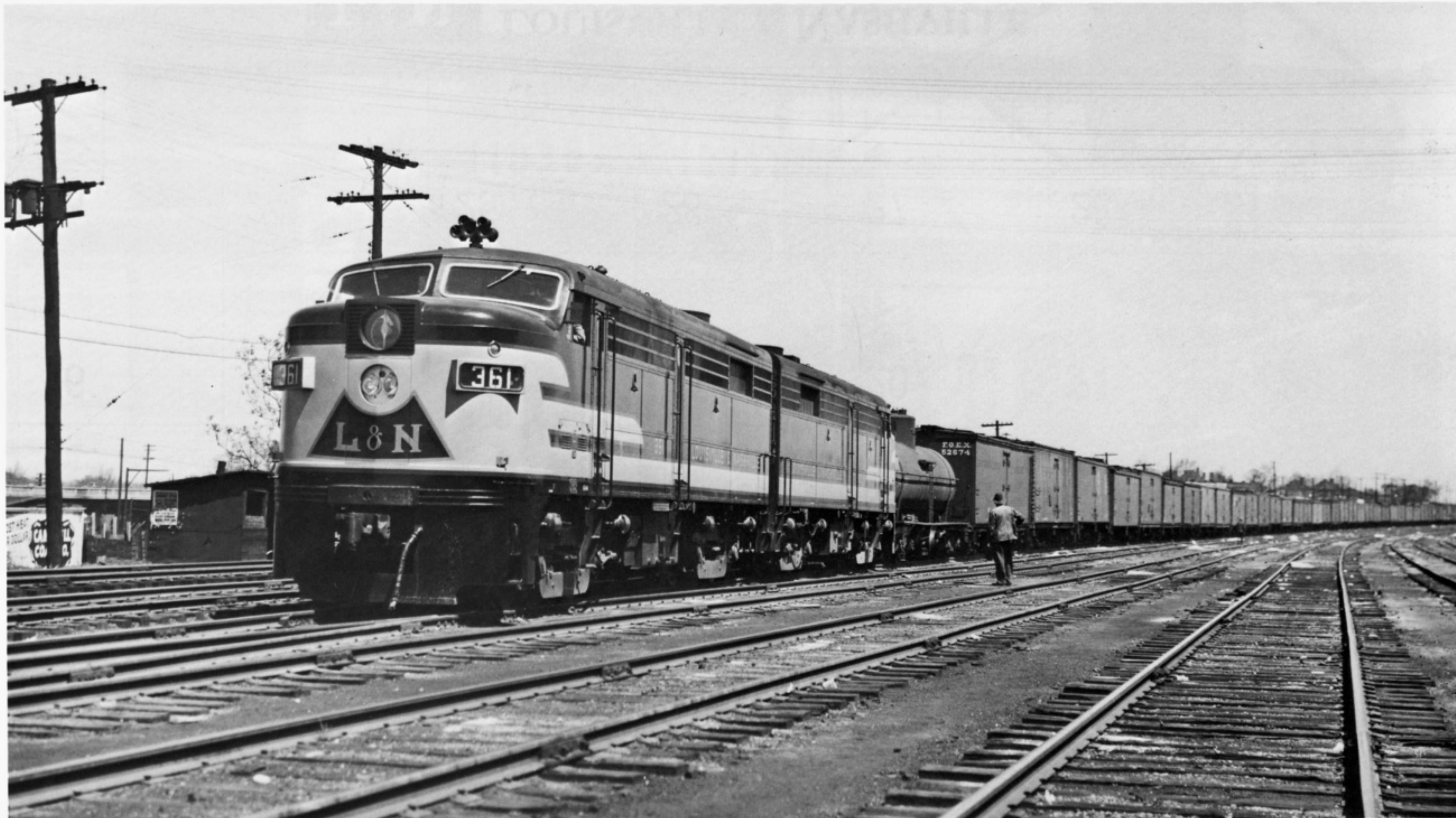
FA2's 361 and 360 are ready to roll from Atlanta's Hulsey Yard in 1952 with train no. 42 to Cincinnati. The first 30 cars following the tank car are reefers (refrigerator cars), reflecting the heavy perishable business that L&N once handled on this route.