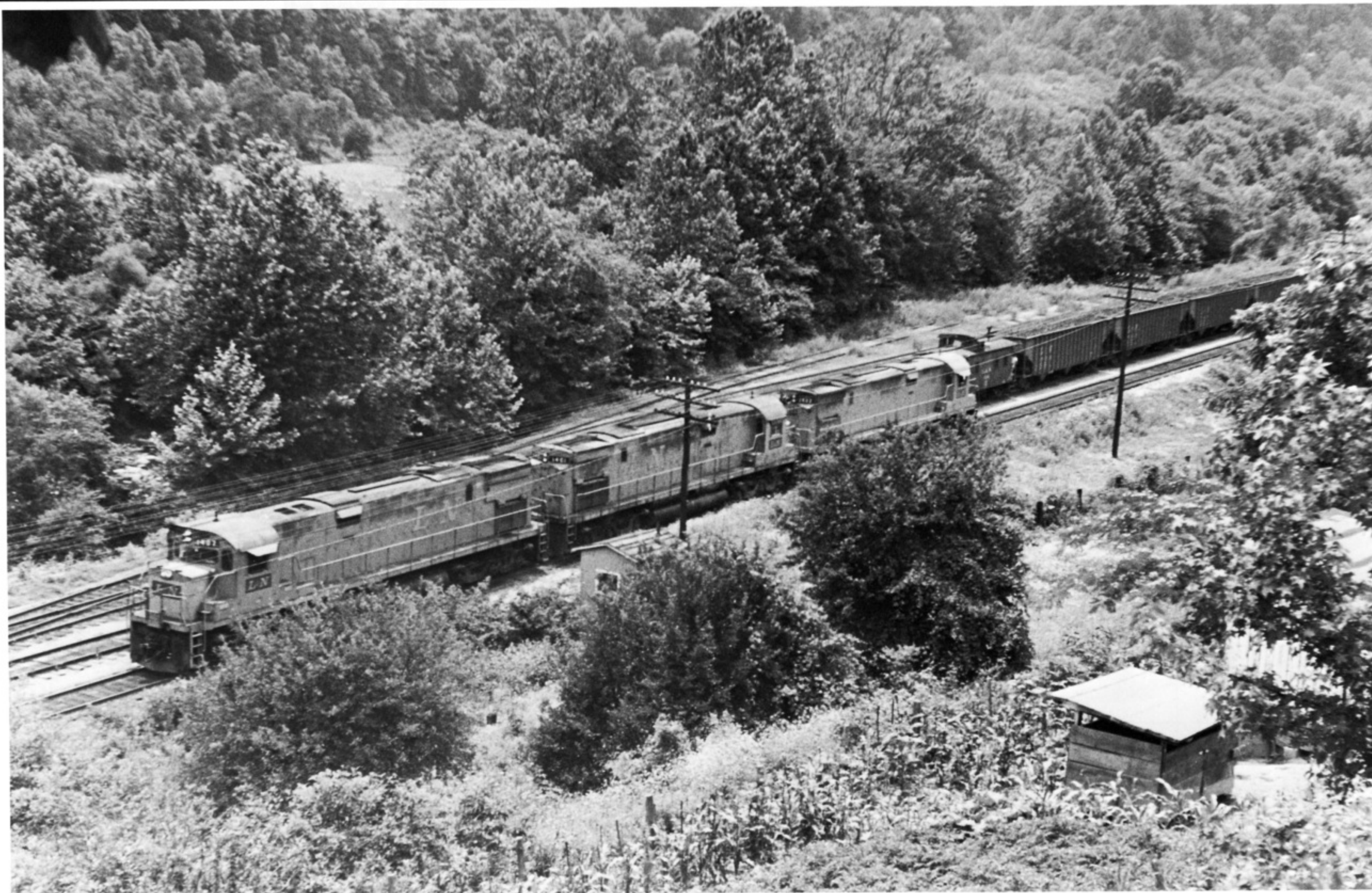
The very first six-motor units to operate on the Cumberland Valley Division was this trio of C628's at Chad, Kentucky on June 30, 1965. Engines 1407, 1401 and 1402 have just arrived "light" from Corbin and have tacked the wooden caboose onto a cut of loaded 100-ton "Steel Train" hoppers. For the next two days, the consist will work back toward Corbin, stopping frequently for publicity photos and movie footage for a U.S. Steel television commercial.