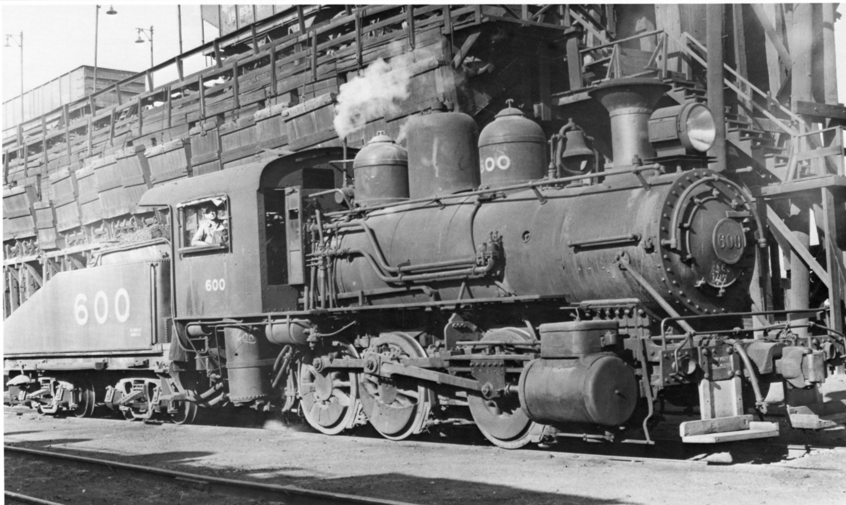
L&N managed to get an incredible amount of service from some of its steam locomotives. Case in point: B-6 no. 600 was rebuilt from an H-1 class Consolidation of the same number, built by Rogers in 1884. When the engine was retired about a year and a half after this April 6, 1947 photo at Birmingham's Boyles Yard, the engine rounded out nearly 64 years of service. Note the unusual spark arrestor on the engine's stack.