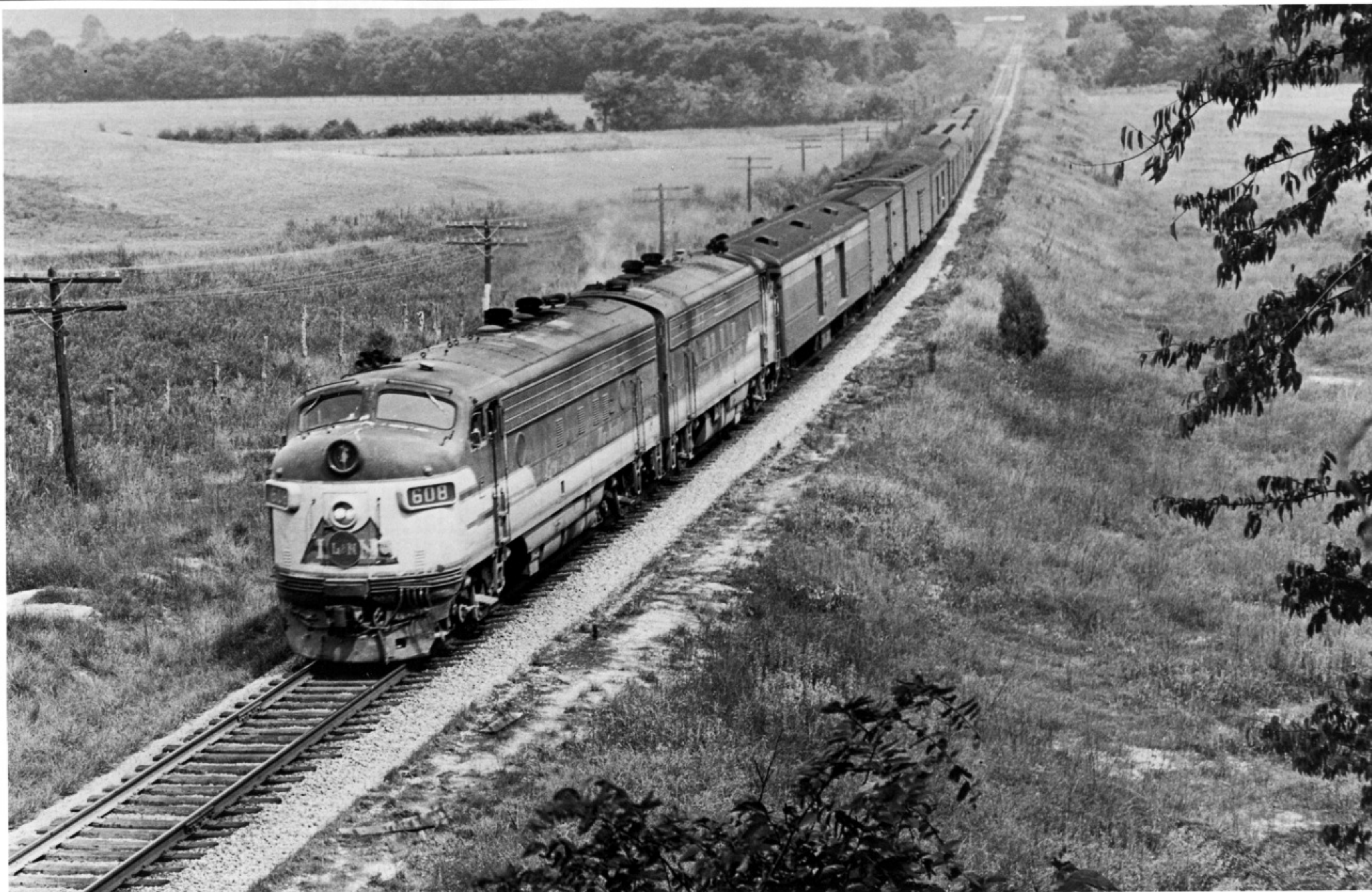
The northbound Dixie Flyer , train 94, rolls through “rip-rap” territory near Wartrace, Tennessee in August 1963. FP7’s 608 and 610 are handling an 11-car train, all head-end traffic except for a single rider coach on the rear. Note the unusual double herald on the 608. Apparently South Louisville intended to repaint the engine into the all-black scheme, attaching the metal “Dixie Line” metal reflective herald over the top of the painted triangular logo.