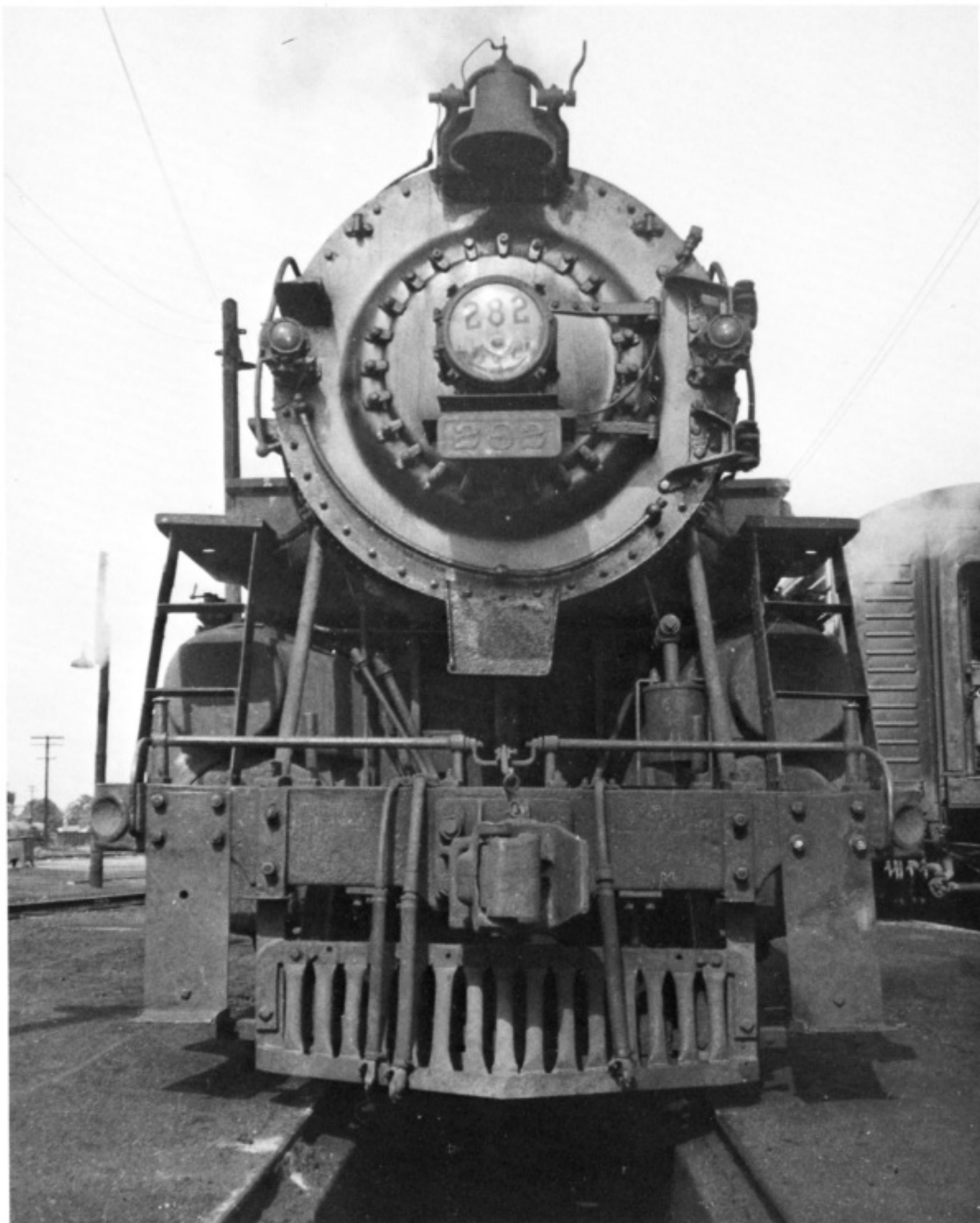
K-5 Pacific simmers between runs at Pensacola, Florida in 1950. The Light USRA engine was built by Brooks in 1924. Bumped from main line runs like the Pan-American and Azalean, the engine finished its service life on secondary passenger runs and locals, duties it was covering at the time of this photo.

The Louisville & Nashville Railroad Historical Society was organized in 1982 for the purpose of collecting, preserving, and sharing information and material relating to the L&N, its predecessors and its successors. The Society is a non-profit educational organization, incorporated in the Commonwealth of Kentucky, and functions strictly with volunteer members serving as Officers.