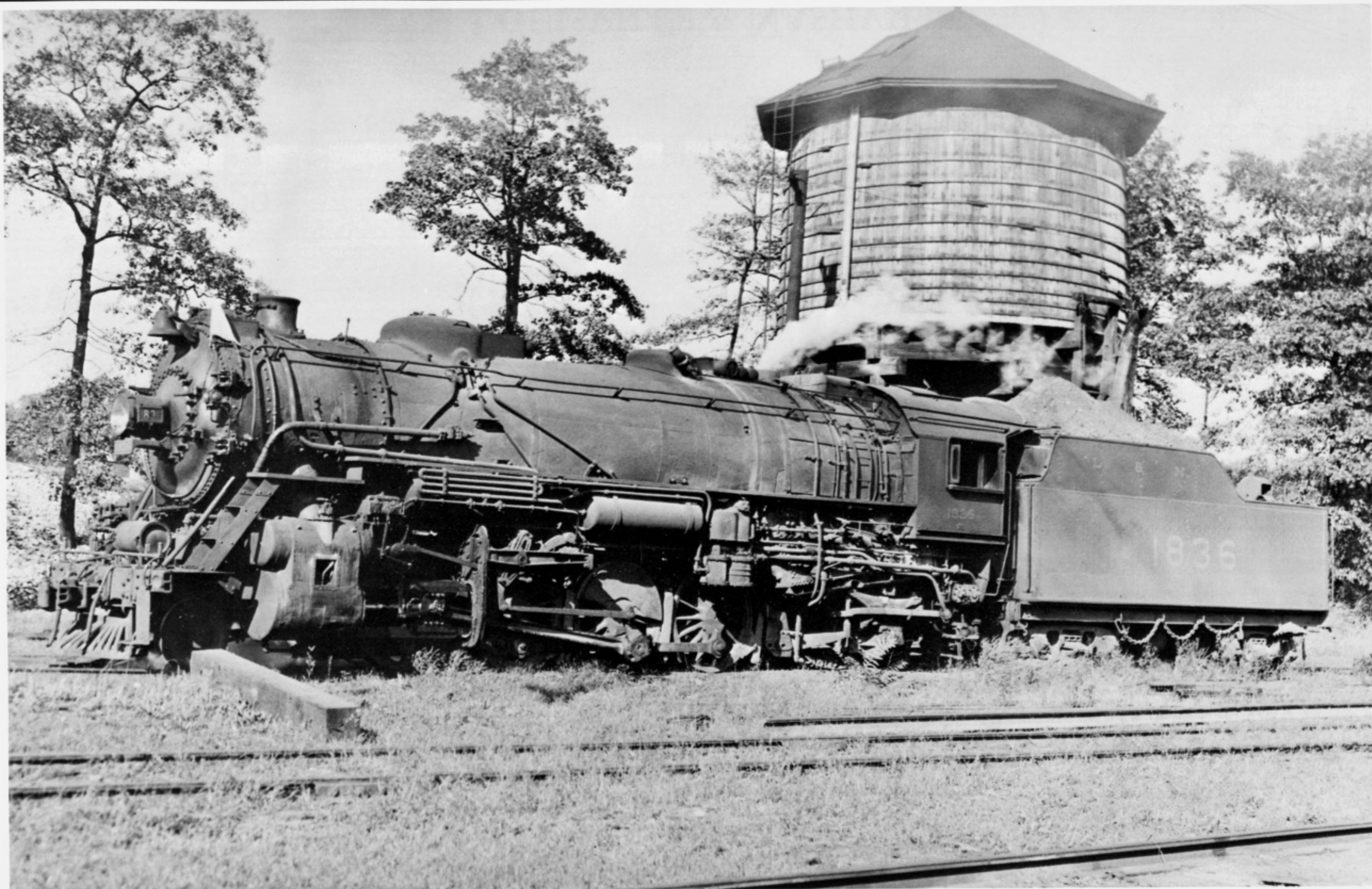
L&N steam was winding down on the Knoxville & Atlanta Division on October 14, 1950 when J-4 class Mike no. 1836 was photographed at the West Knoxville (Tennessee) water tank. The Automatic Train Control-equipped engine will serve the railroad for many more years though, hauling coal on the CV, EK and Cincinnati Divisions until late 1956.