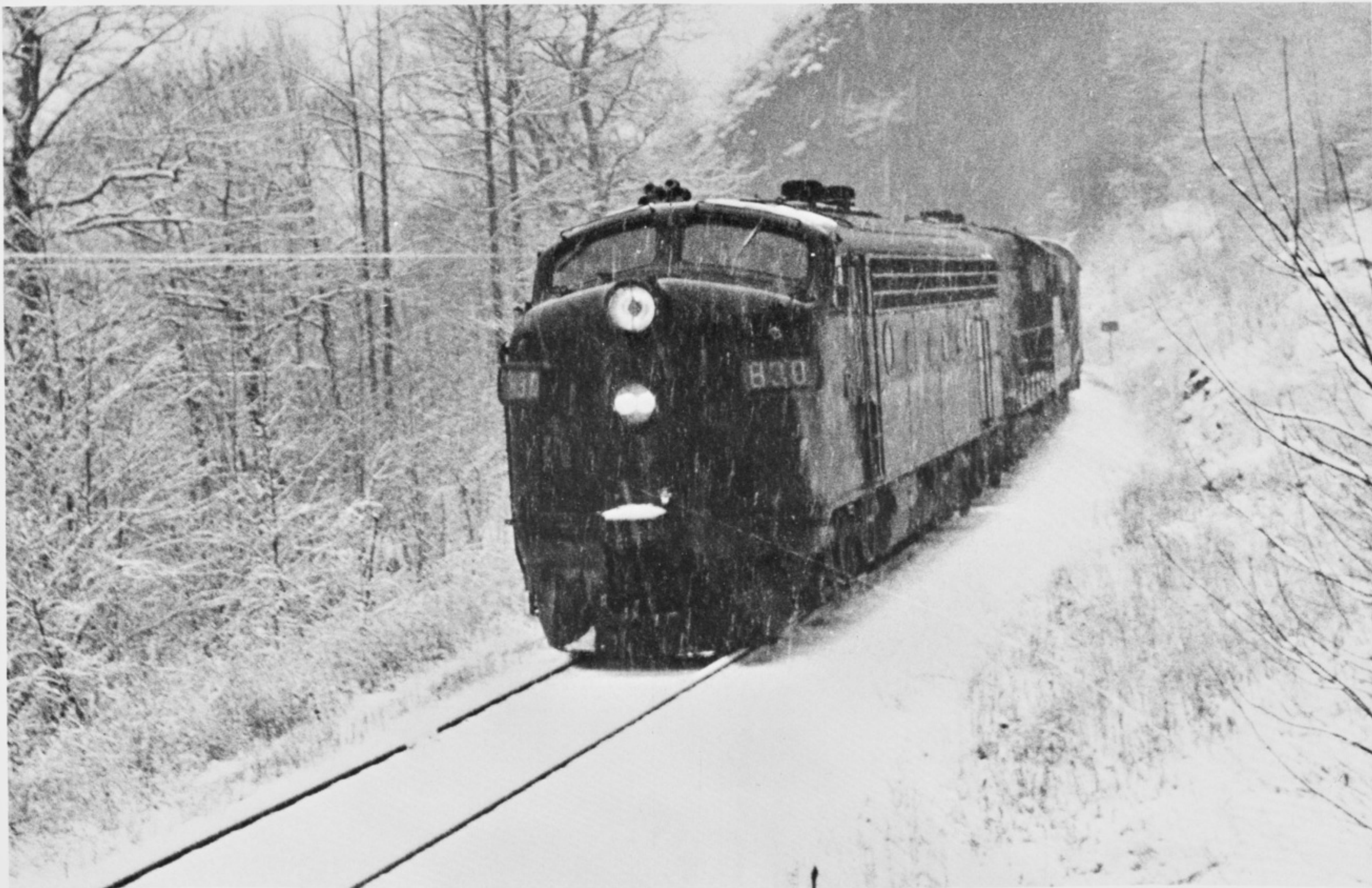
A heavy snowfall blankets southwestern Virginia on December 28, 1964 as CV Division train 66 rolls out of Bee Rock Tunnel near Appalachia. The through freight is making its daily Norton to Corbin run with interchange traffic from the N&W and Clinchfield. Specially-equipped mid-train "slave" F7 no. 830 is up front.