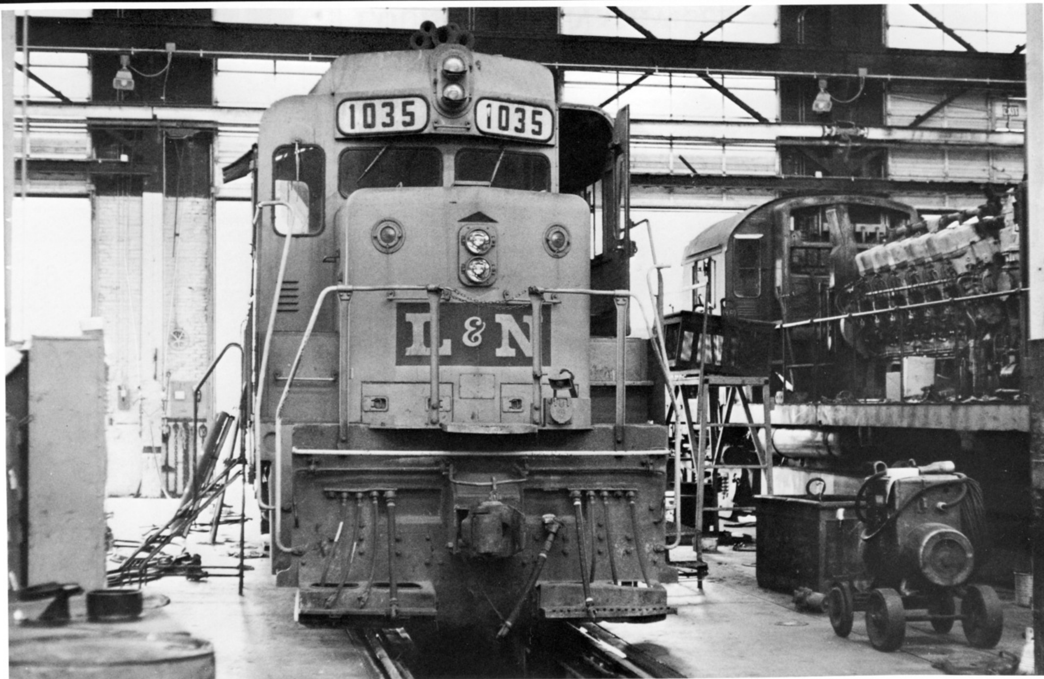
On the last day of July in 1976, GP30 no. 1035 shares shop space at South Louisville with an Alco C420 in the adjacent bay. The veteran unit was built in 1963, and will remain on the active roster until February 1980.