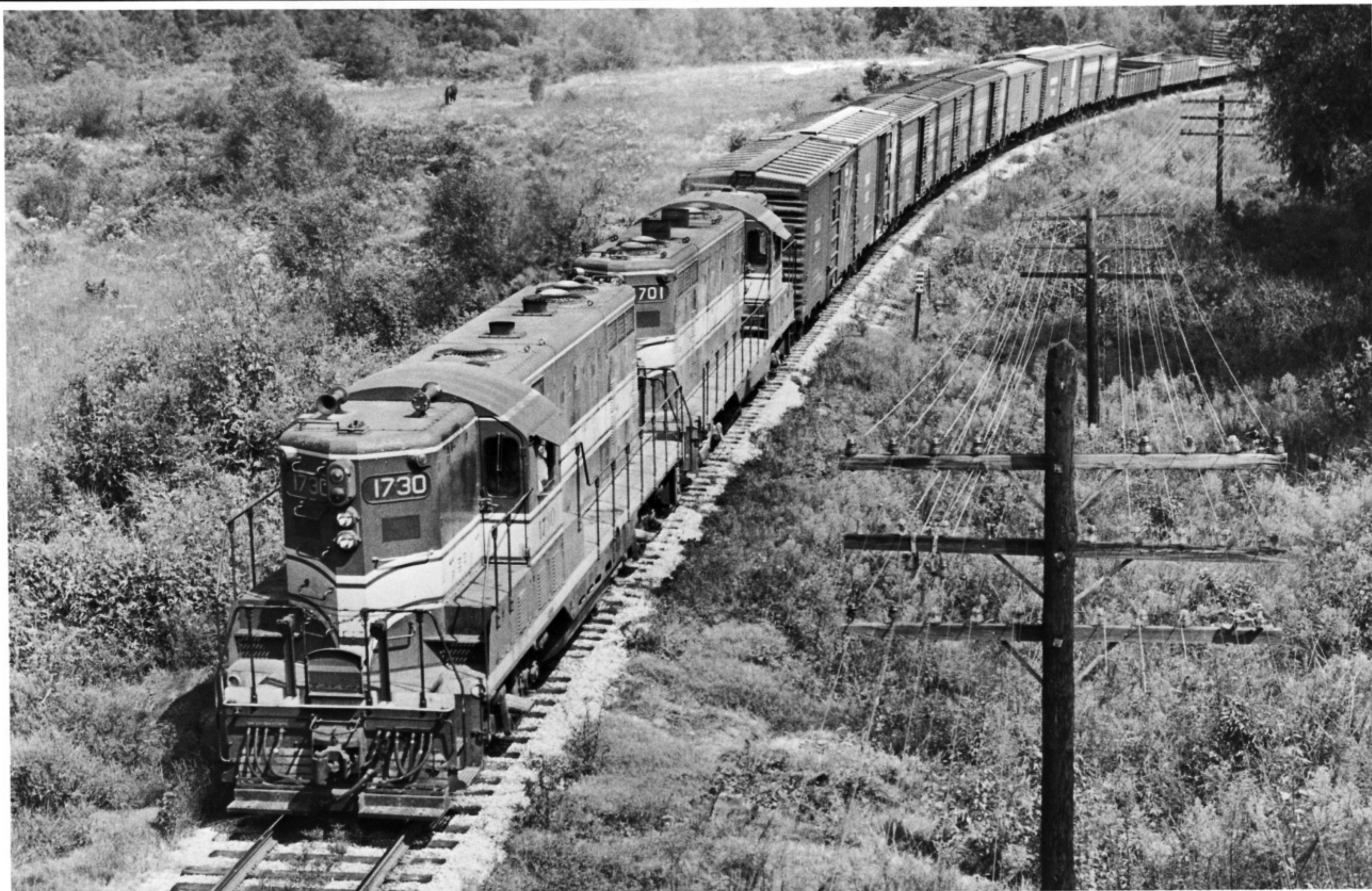
Former NC&StL GP7's 1730 and 1701 head out of Bruceton, Tennessee in September 1959 with the local freight for Union City. No less than four "To and From Dixieland" yellow-stripe box cars are in the train. Note the obsolete "two longs and two shorts" whistle post. This was the standard grade-crossing whistle signal for many railroads until superseded by the more familiar "two longs, a short, and a long."