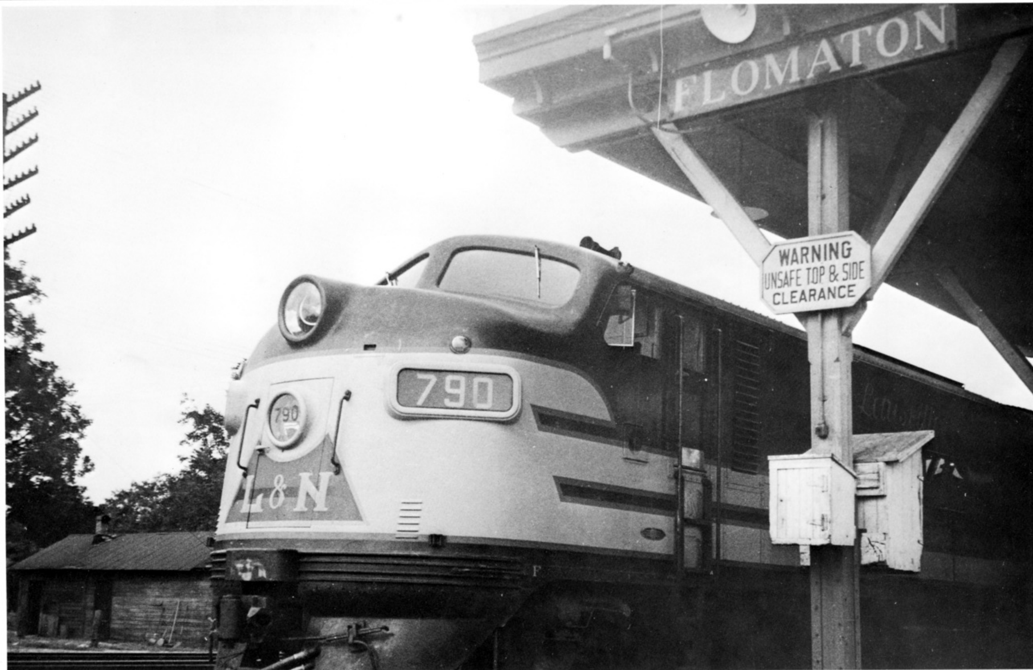
In the summer of 1950, E7 no. 790 stands at the passenger station at Flomaton, Alabama with a through train. The blue and cream speedster is a little more than a year old. Note the painted number on the headlight lens—a holdover tradition from L&N's steam days.