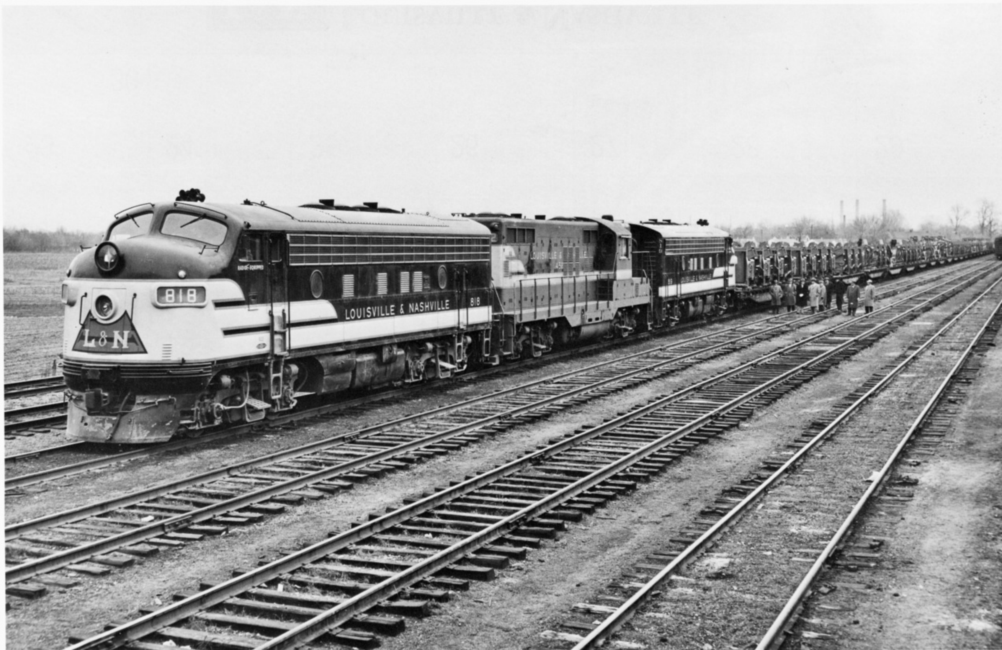
Company officials line up for their portrait at Howell Yard in Evansville, Indiana. The all-EMD lash-up of 818, 452 and 819 (F7A/GP9/F7A) heads up a special movement of Allis-Chalmers farm equipment headed for the Southeast. The date is February 15, 1957.