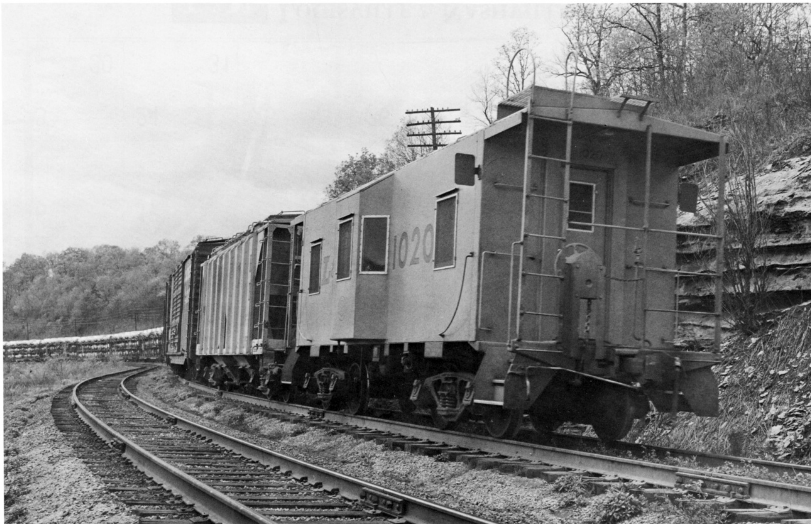
A South Louisville-built "shorty," no. 1020, brings up the rear of southbound fast freight no. 77 on Muldraugh Hill. The train is climbing the famed grade between Lebanon Junction and Elizabethtown, Kentucky on April 30, 1964. The uncovered automobiles on the tri-levels suggest a more innocent time, when vandalism wasn't quite so rampant.