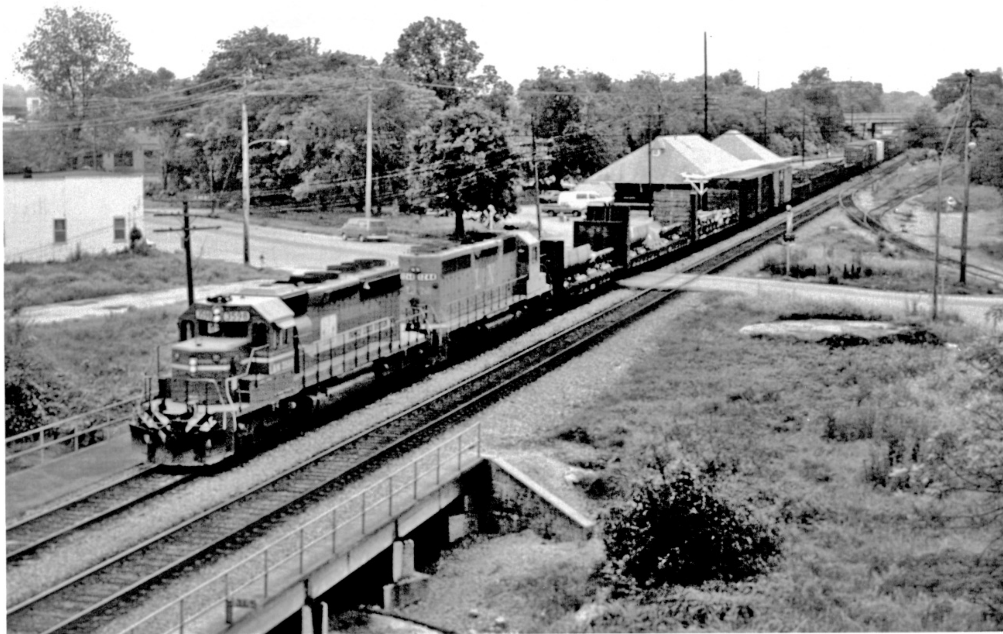
Train 624 accelerates after making a brief stop at Murfreesboro, Tennessee on May 12, 1981. This was the former NC&StL Nashville-Atlanta main line.