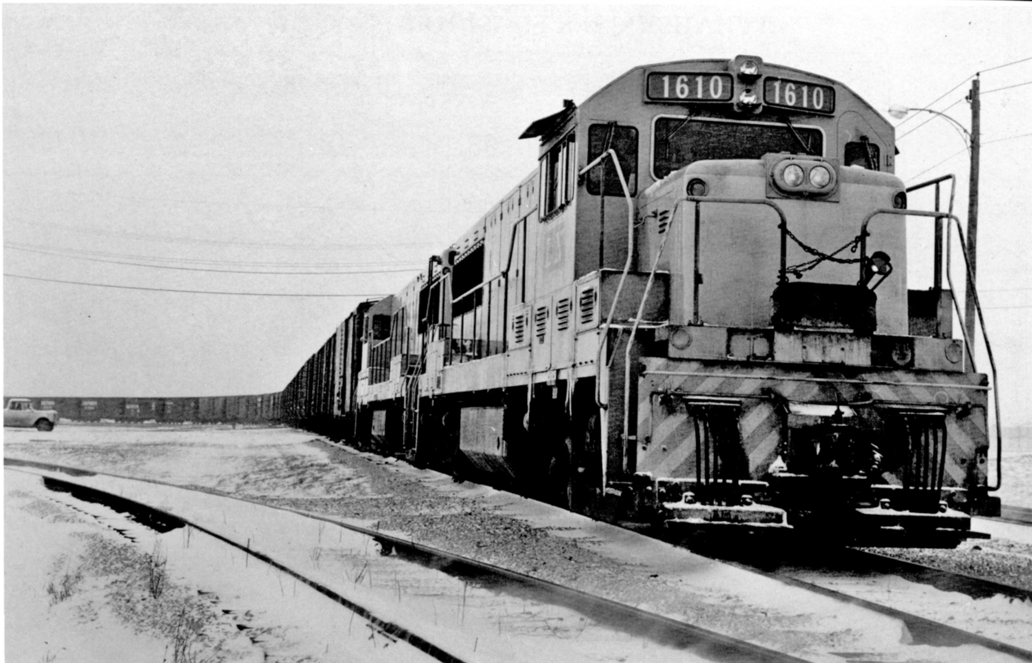
On a cold and snowy February 25, 1965, two U25Bs switch General Electric's Appliance Park in Louisville.