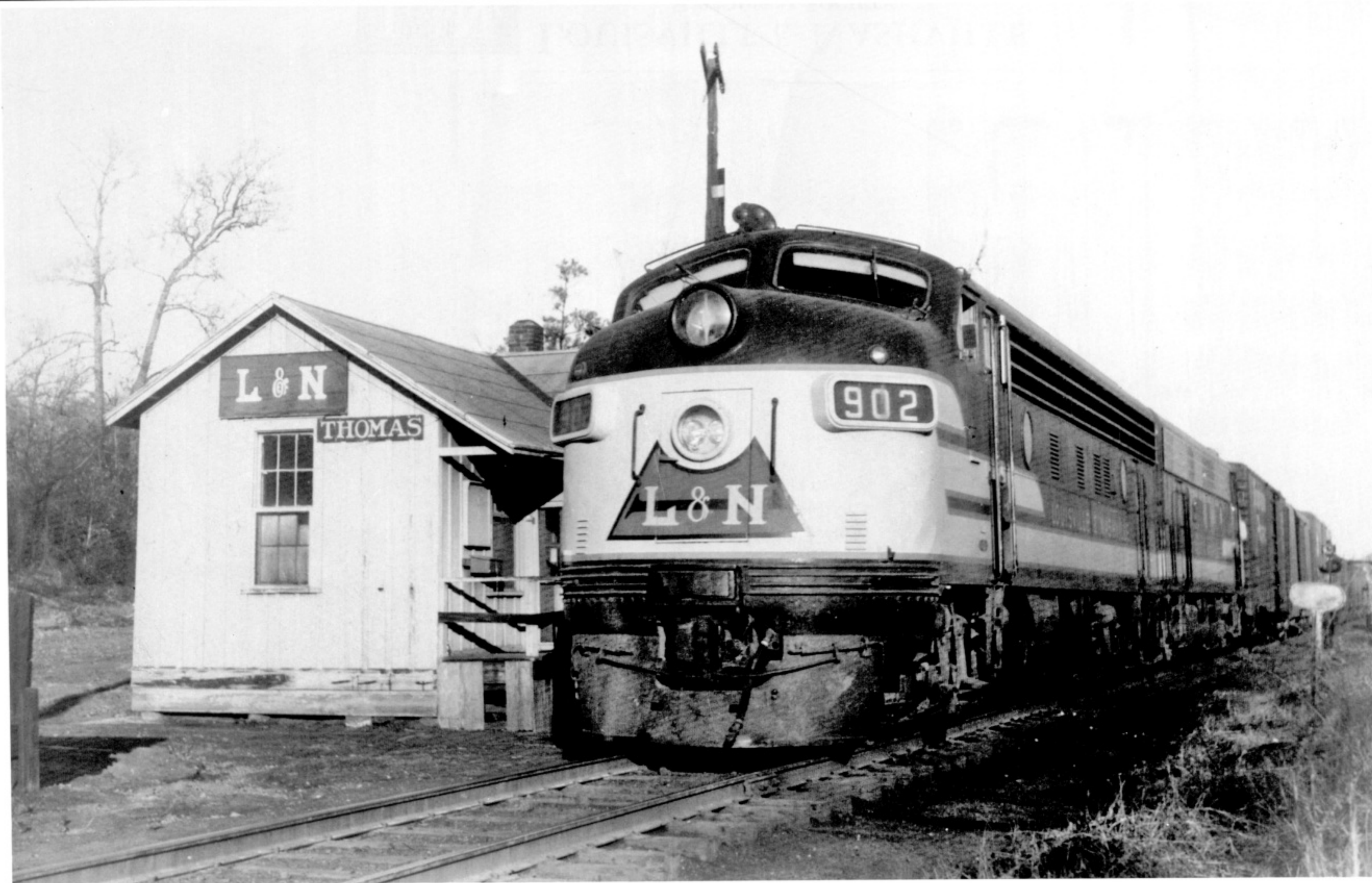
On the Birmingham Mineral Railroad, a pair of Fs passes the train order station at Thomas, Alabama in November 1958.