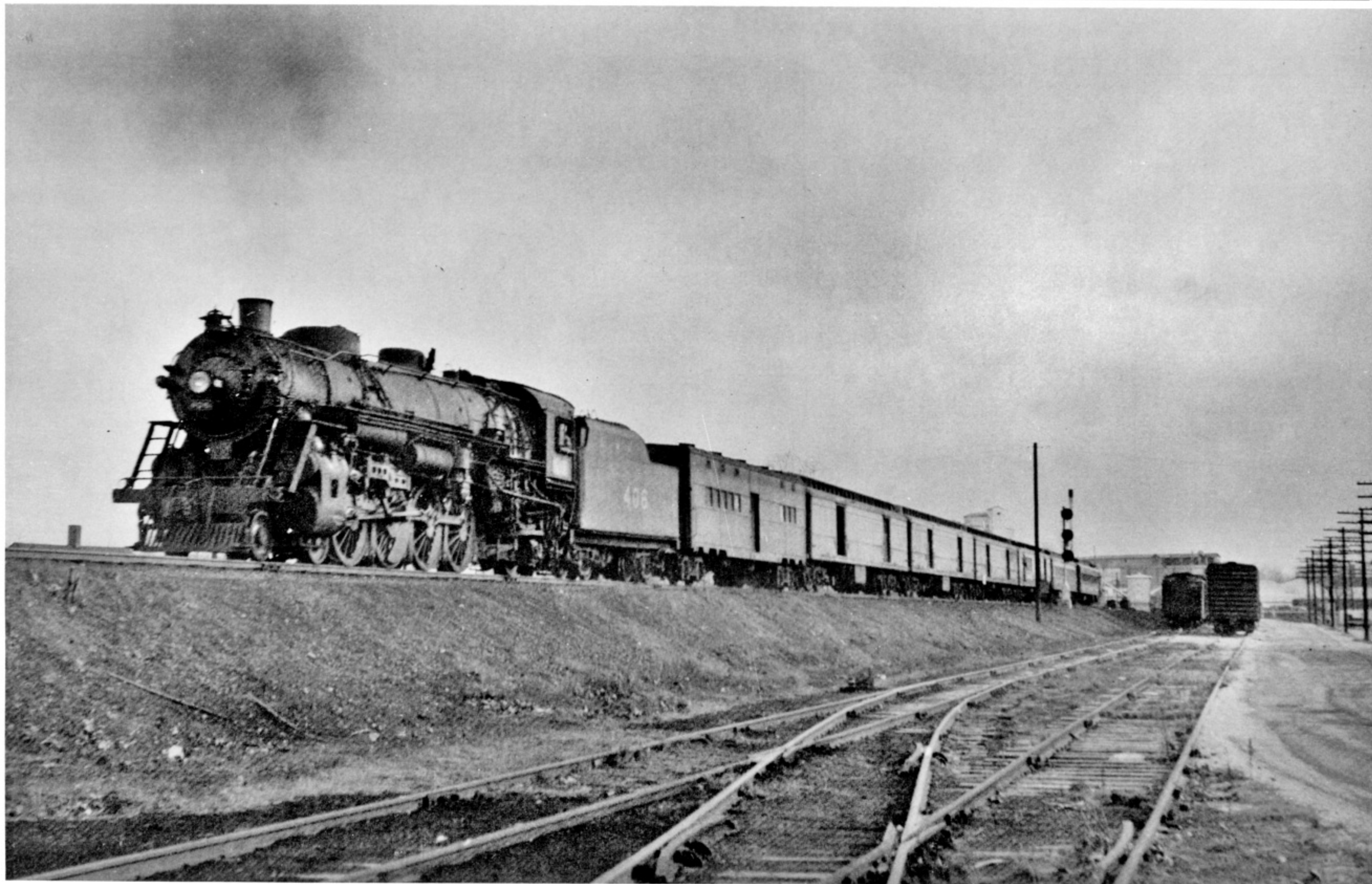
Evansville-St. Louis day local 92 hammers out of Howell, Indiana in 1950 with L-1 406 on the point.