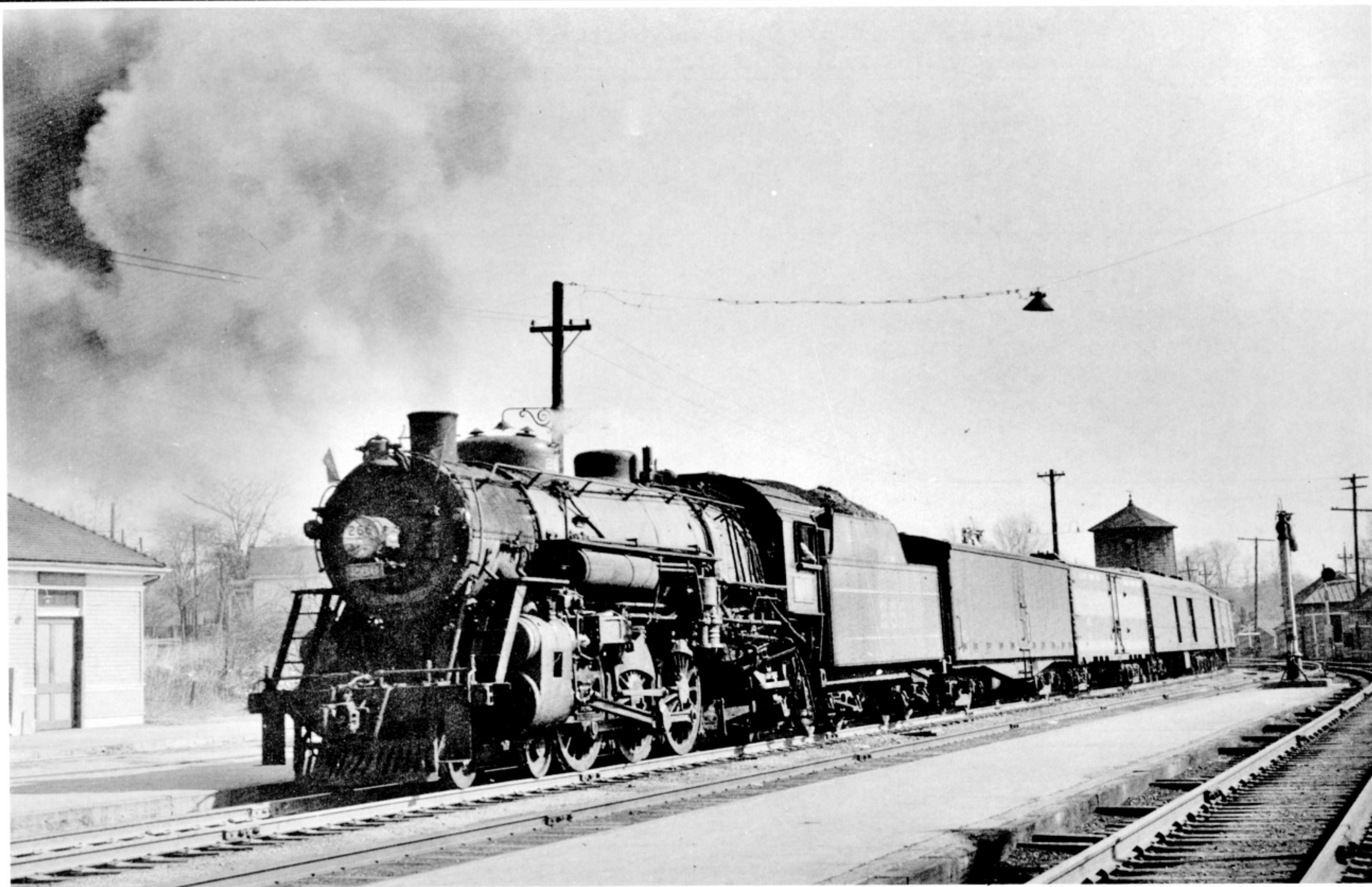
A mail and express section of train 33, the southbound Southland , rolls into Paris, Kentucky behind K5 Pacific 266. The green flags denote a following section, probably carrying Pullmans.