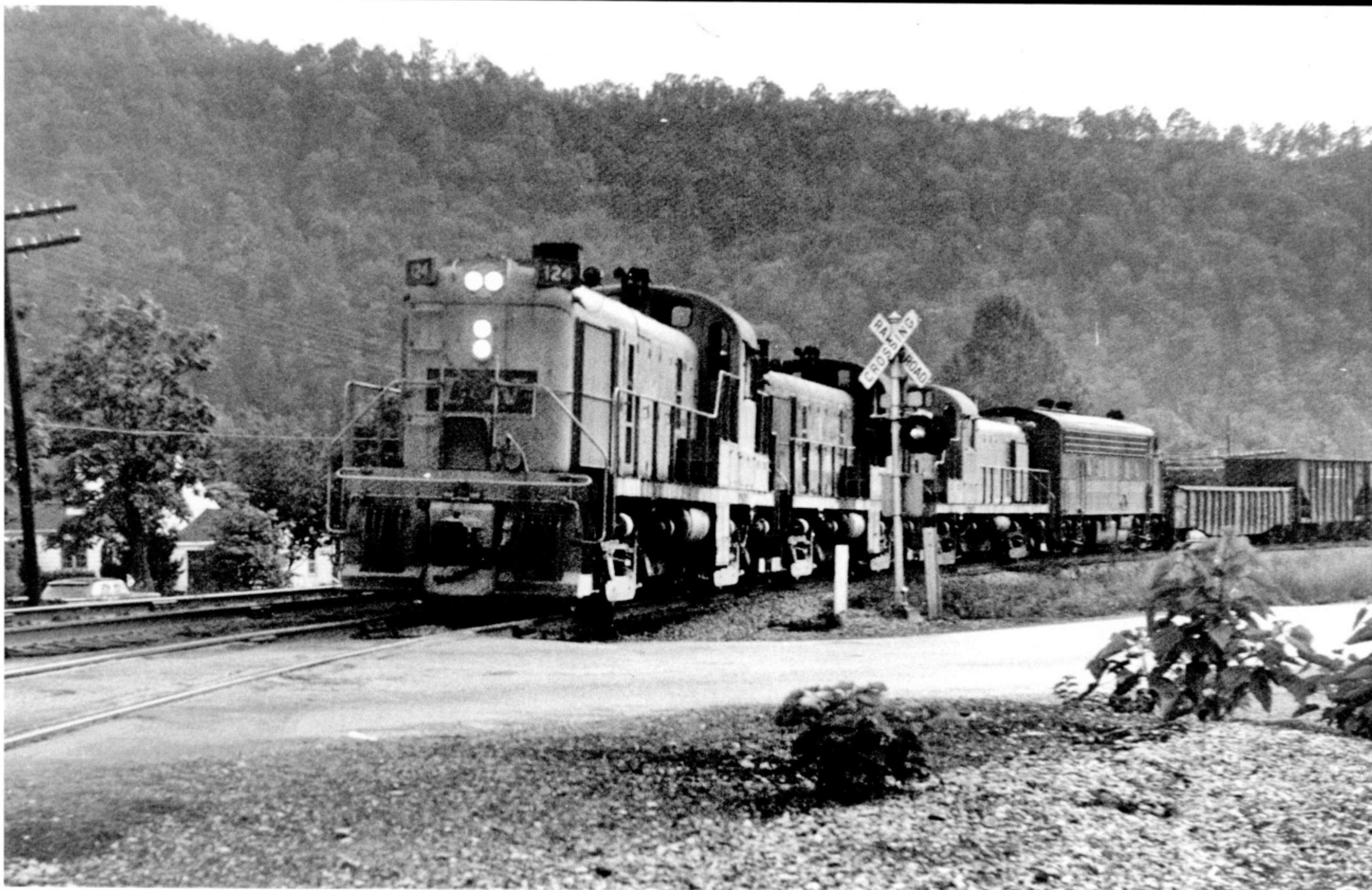
Cumberland Valley Division train 65 swings through Emerling, Kentucky in June 1965 behind three RS3s and an F7A. The double tracks crossed U.S.119 at this point, about a mile outside of Loyall Yard.