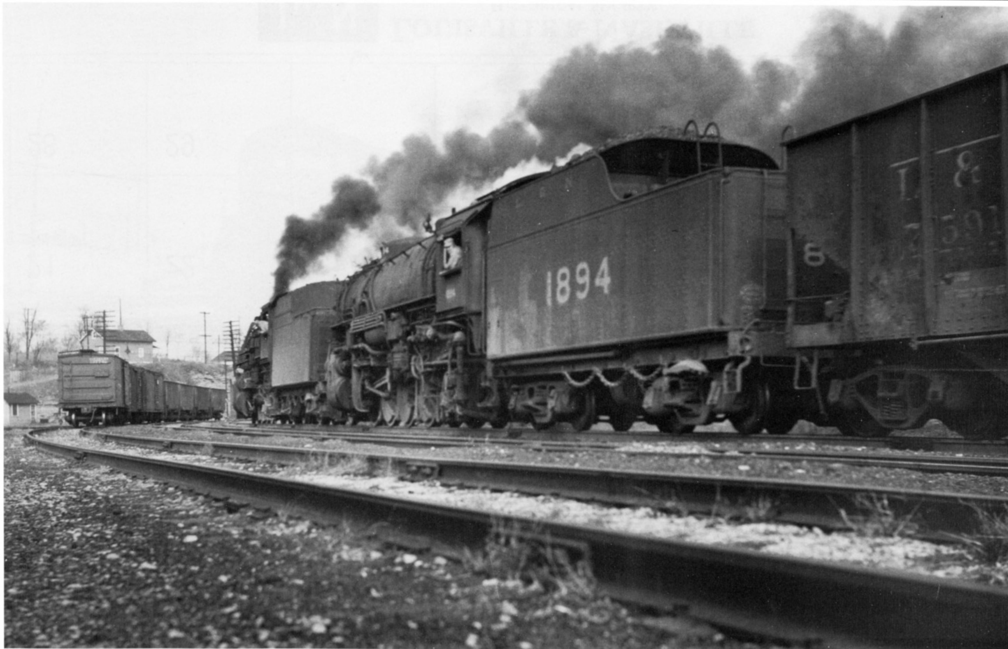
In 1950, a J2A/J4A tandem swings around the east leg of the wye at Patio, Kentucky with an EK Division coal train. The grade has eased at this point, but another 2-8-2 is still working hard behind the extra drag's caboose. Helpers were dropped just east of this point.