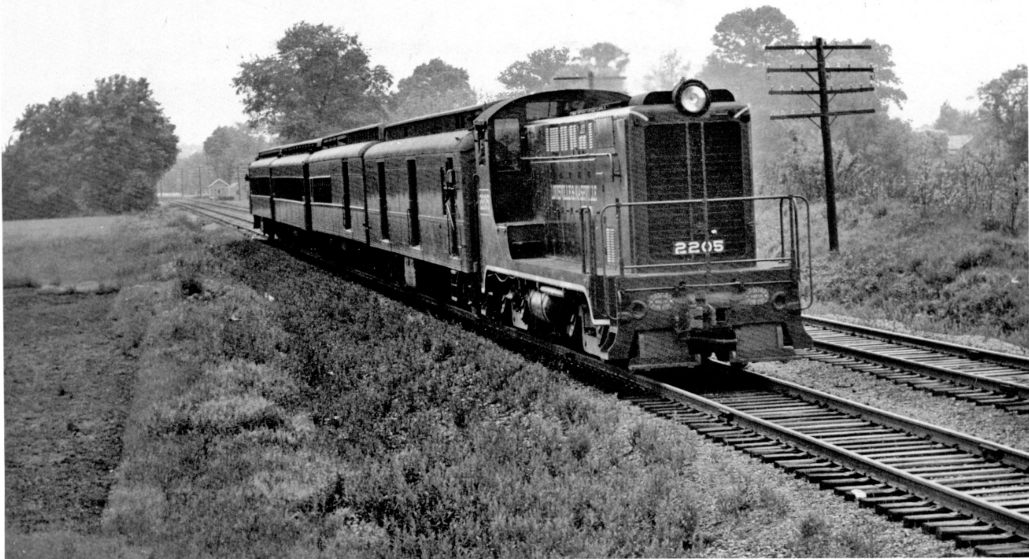
On May 11, 1946, Baldwin switcher 2205 handles train 20, the "Bluegrass Local," south of Anchorage, Kentucky. A coal strike necessitated this substitution of internal combustion power in lieu of train 20's normal Pacific.