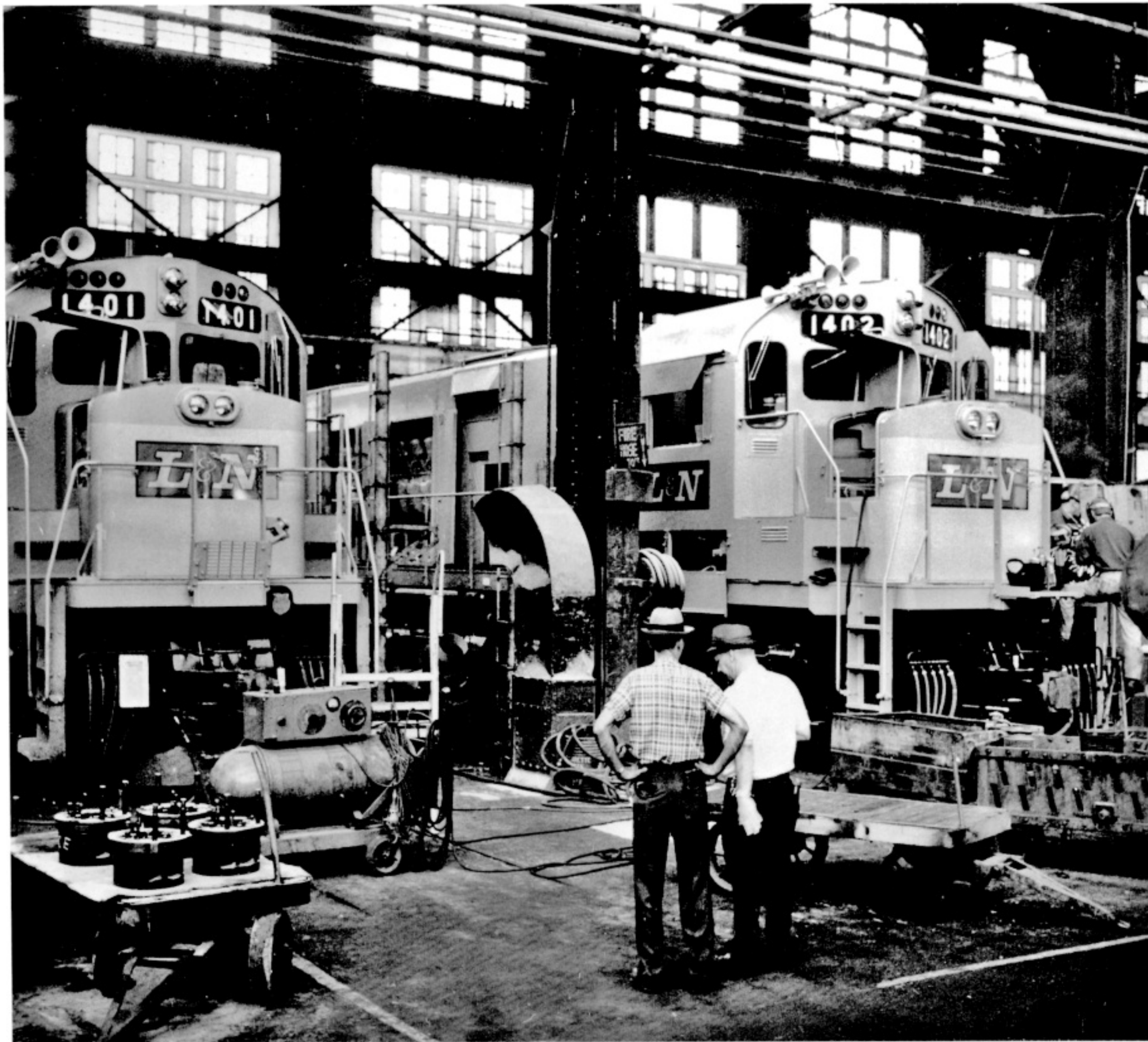
Brand new C628s 1401 and 1402 are being fitted with radios and other appurtenances at South Louisville in 1964. The big Alcos were the first six-motor power purchased by the L&N, and the first new units with dynamic brakes.