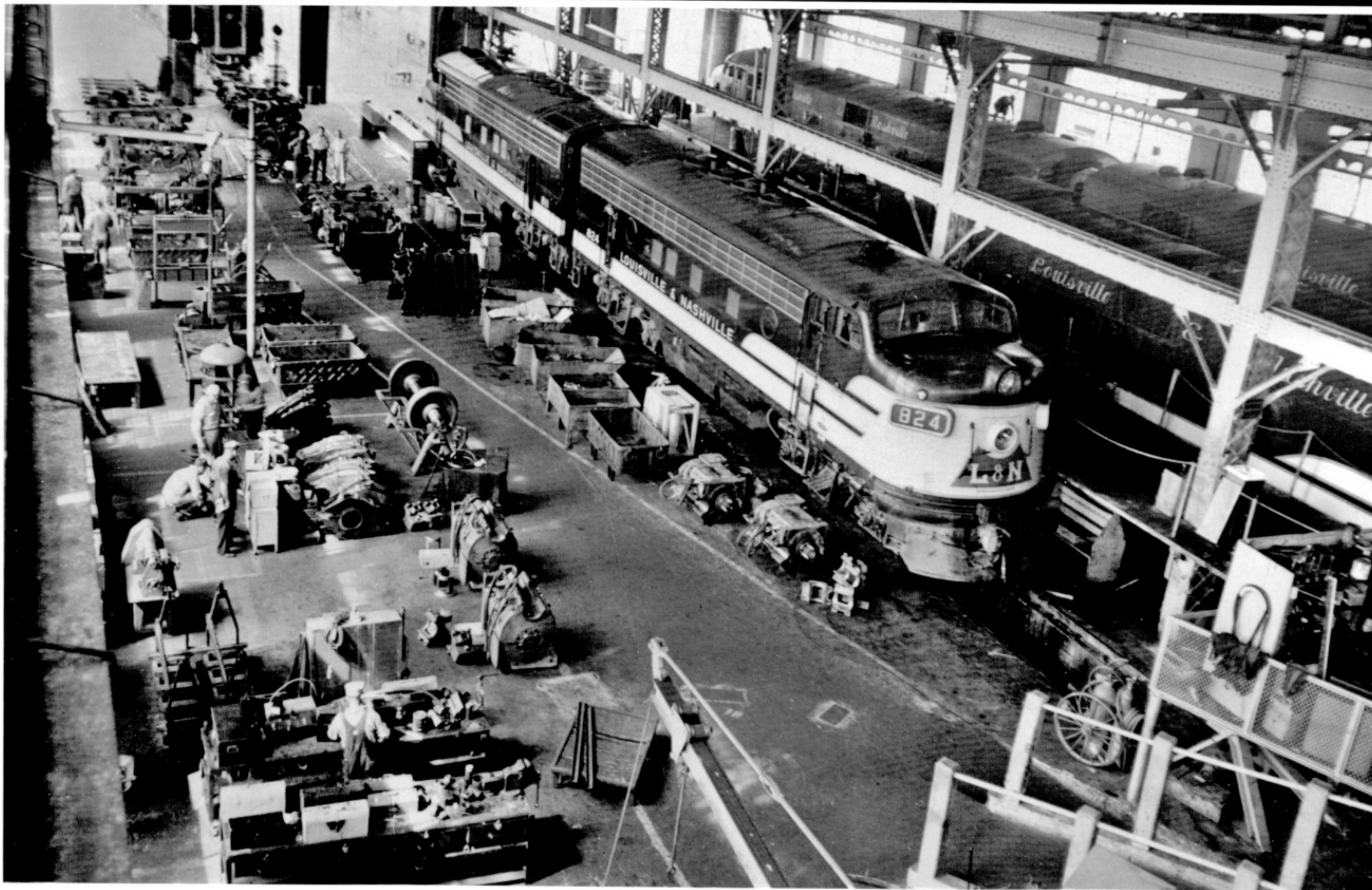
The maintenance bays at South Louisville's Shop 17 hold a pair of F7s, 824 and 811, and—to the right—several E6 and E7 passenger units. This scene was recorded on June 29, 1951.