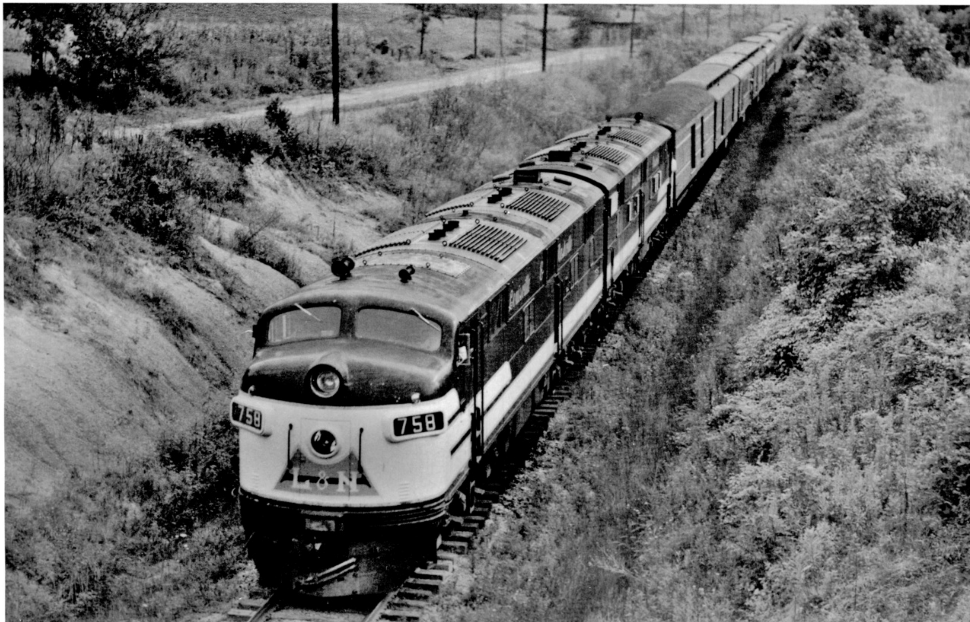
Northbound train 32, the Southland, rolls along the Knoxville & Atlanta Division "New Line" near Chatsworth, Georgia around 1950. The two Es are heading up a 13 car consist, bound for Cincinnati and destinations in the Midwest.