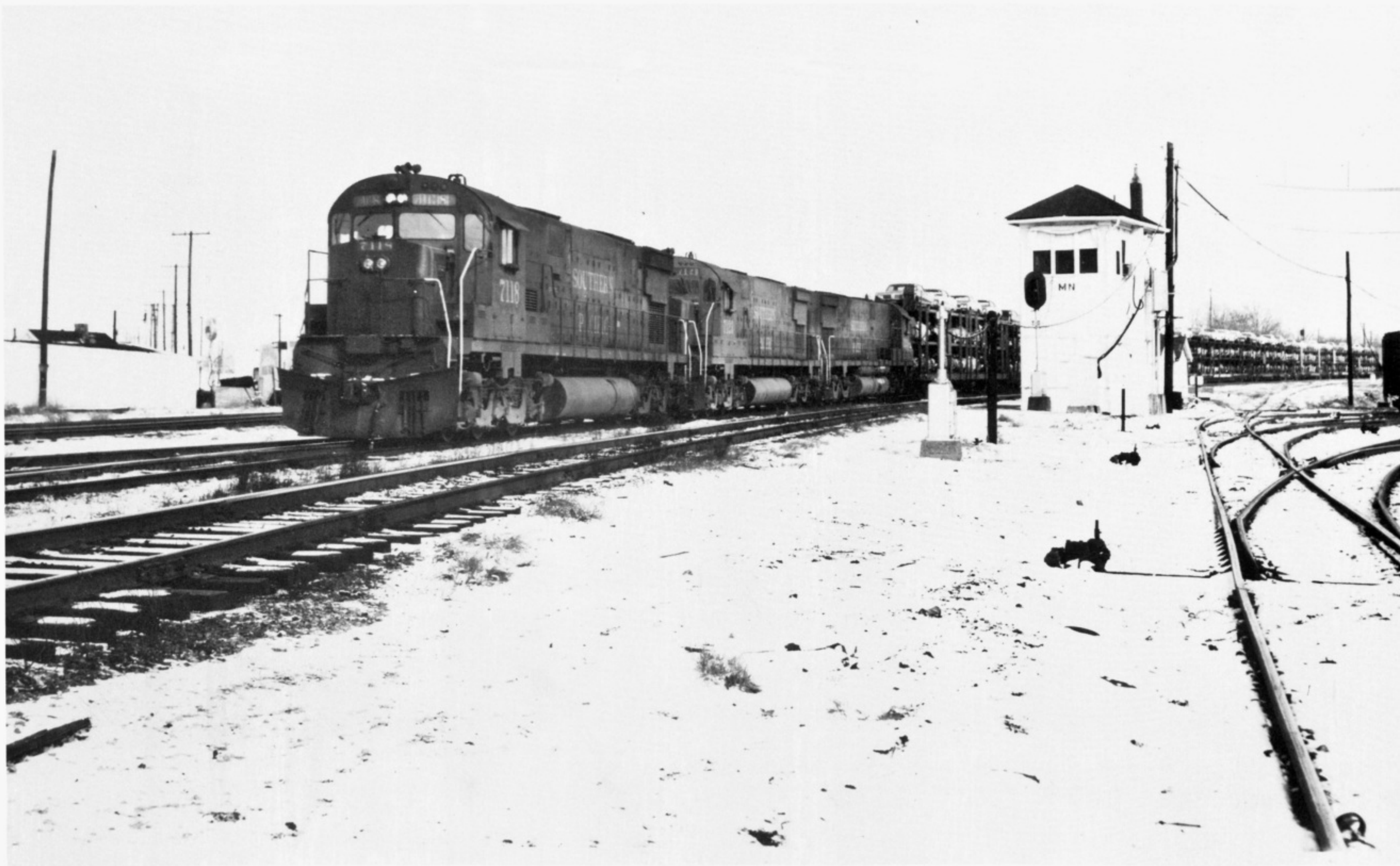
Leased Southern Pacific Alco C628s roll southward past MN Tower at East Louisville in 1971. The gray and scarlet-nosed units were part of a group leased at the time to help the L&N through a power shortage. The train includes a large cut of loaded tri-levels.