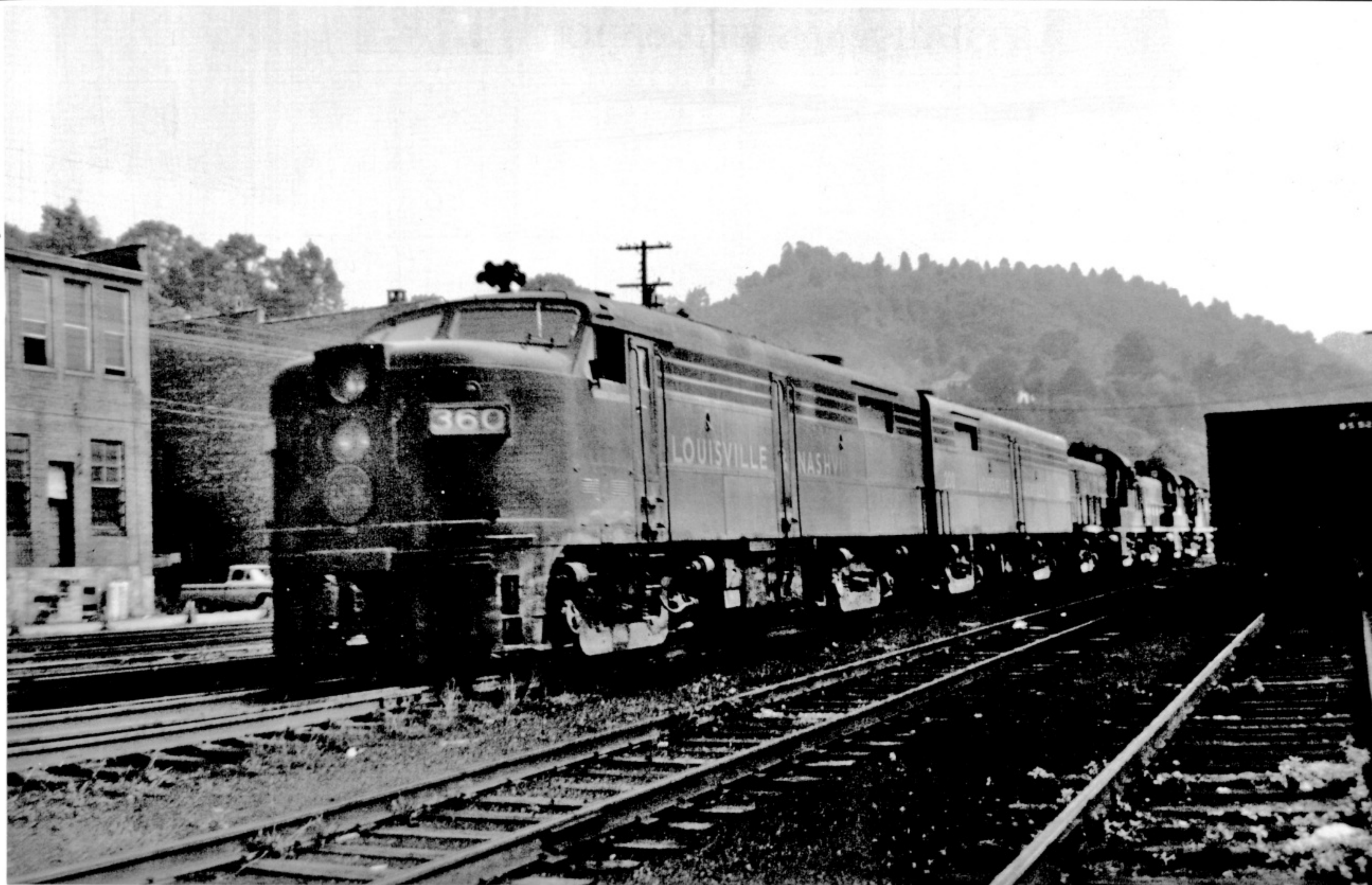
CV train 66 rolls through Appalachia, Virginia on October 2, 1963 behind five Alcos, an FA2, FB2, and three RS3s. The 360 is a visitor, as either the 313 or 321 normally handled this assignment.