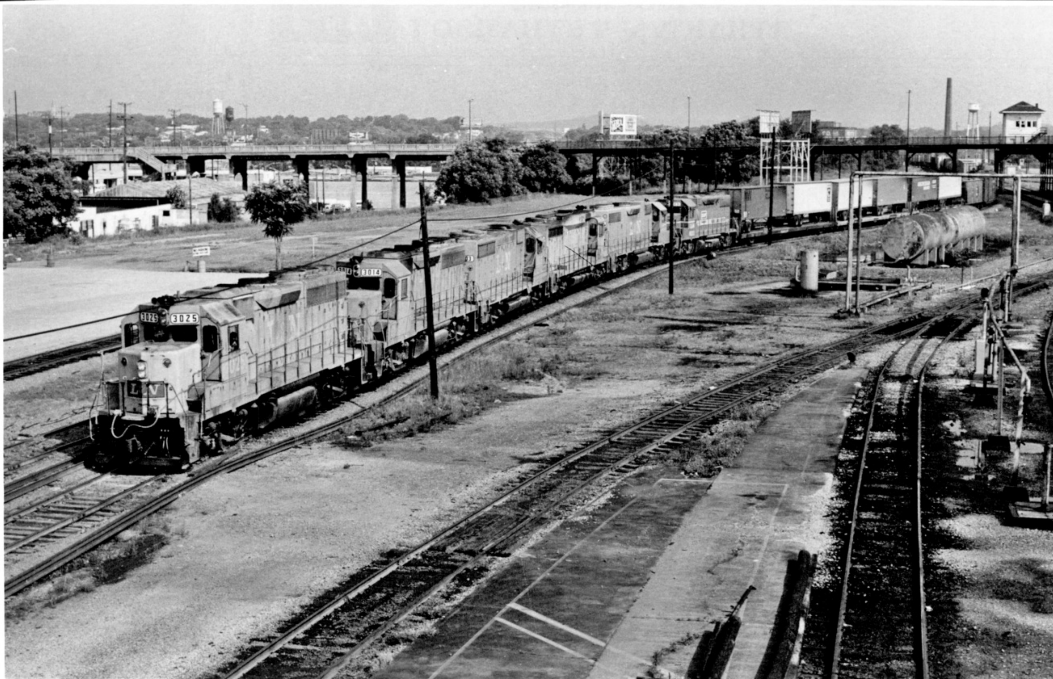
Train 581 eases by Nashville Union Station on June 1, 1980. Six EMD four-axle units handle the pulling chores.